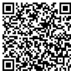
SOP 3.3 Surf Club Patrol Requirements